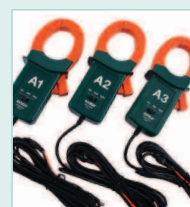
Model PQ34-12 1200A Current Clamp Probes with 2" (50mm) jaw size