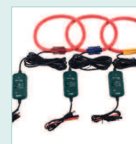
Model PQ34-30 3000A (24"/600mm) Flexible Current Clamp Probes for wrapping around busbars